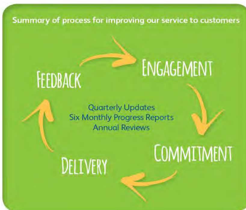
Figure 01 Summary of process for improving our service to major customers

Engagement with our customers is the primary way that we use to identify what is important to them. It is how we ensure that our initiatives and commitments are the correct ones to meet their needs. The initial step in our engagement plan was to identify the issues that are key to our customers and ensure that we fully understood them. Following this we developed a set of initiatives and commitments and discussed these with our customers to check that they would address the issues raised. We then delivered these, reporting back to customers on our performance against these commitments and received feedback. This feedback has informed our next set of targets. This process is illustrated in Figure 01.