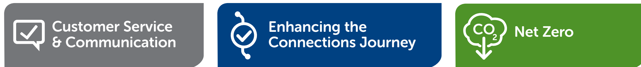
Figure 2: Three strategic pillars

Together with Expert Panel members, we identified three strategic pillars we want to focus on for the remaining two years of RIIO-ED1. Our commitments are categorised into these pillars. These can be seen on pages 5-7 in the commitment table and in figure 2.